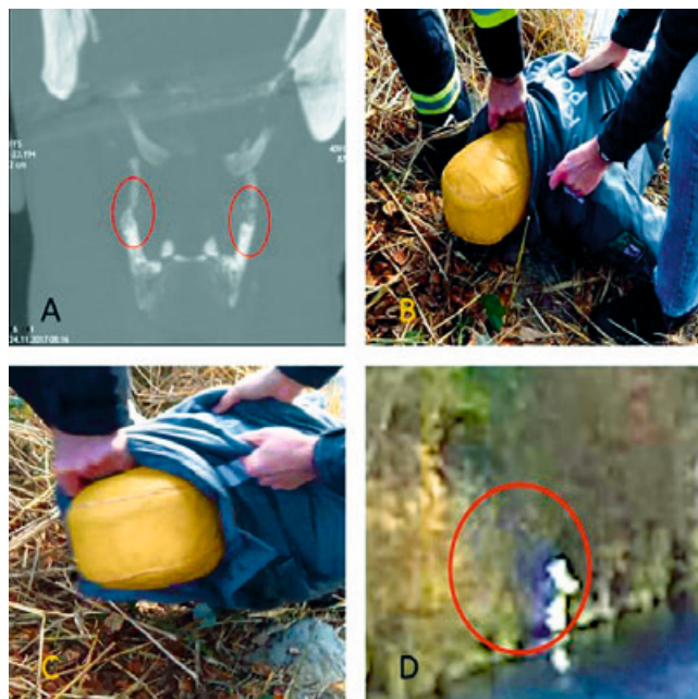
Fig. 2. A: Laryngeal fractures in the postmortem CT-imaging (outlined). B: Reconstruction of the recovery. C: Reconstruction of the recovery with powerful pulling at the collar. D: Excerpt from the surveillance camera recording [outlining by the police]. In the video can be seen that the woman jumps into the water and no other persons are at the scene.

in the soft tissues next to the articulation between the cricoid and the thyroid cartilage were detected.