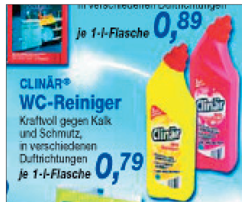
Fig. 7. Toilet bowl cleaner CLINÄR® Рис. 7. Средство для чистки унитаза CLINÄR®

background in one third of the cases of corrodible injections [1], only 27 lethal outcomes (n = 206,636) were reported after detergent ingestion in another study [5].