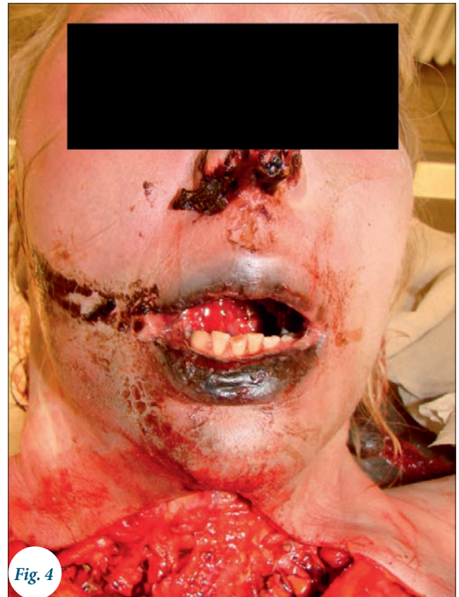
Fig. 1-4. Extensive destruction of the gastric and esophageal mucosa with hematemesis after lethal toilet-cleaner intoxication Рис. 1-4. Обширные дефекты слизистой оболочки желудка и пищевода с признаками рвоты кровью после смертельного отравления средством для чистки унитаза